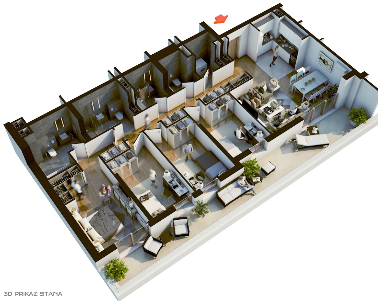
3D PRIKAZ STANA