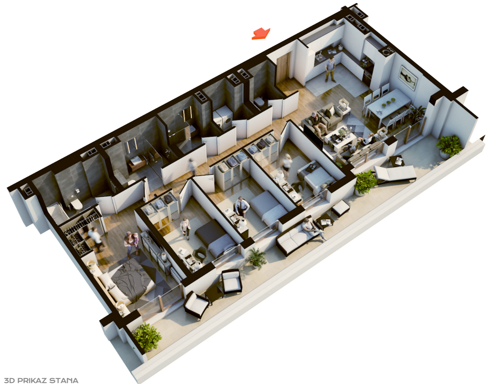
3D PRIKAZ STANA