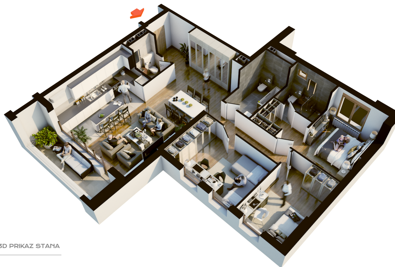
3D PRIKAZ STANA