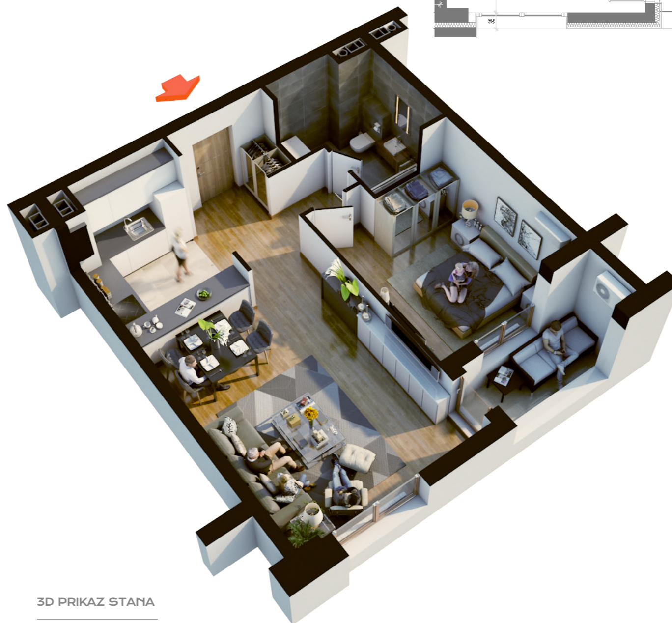
3D PRIKAZ STANA