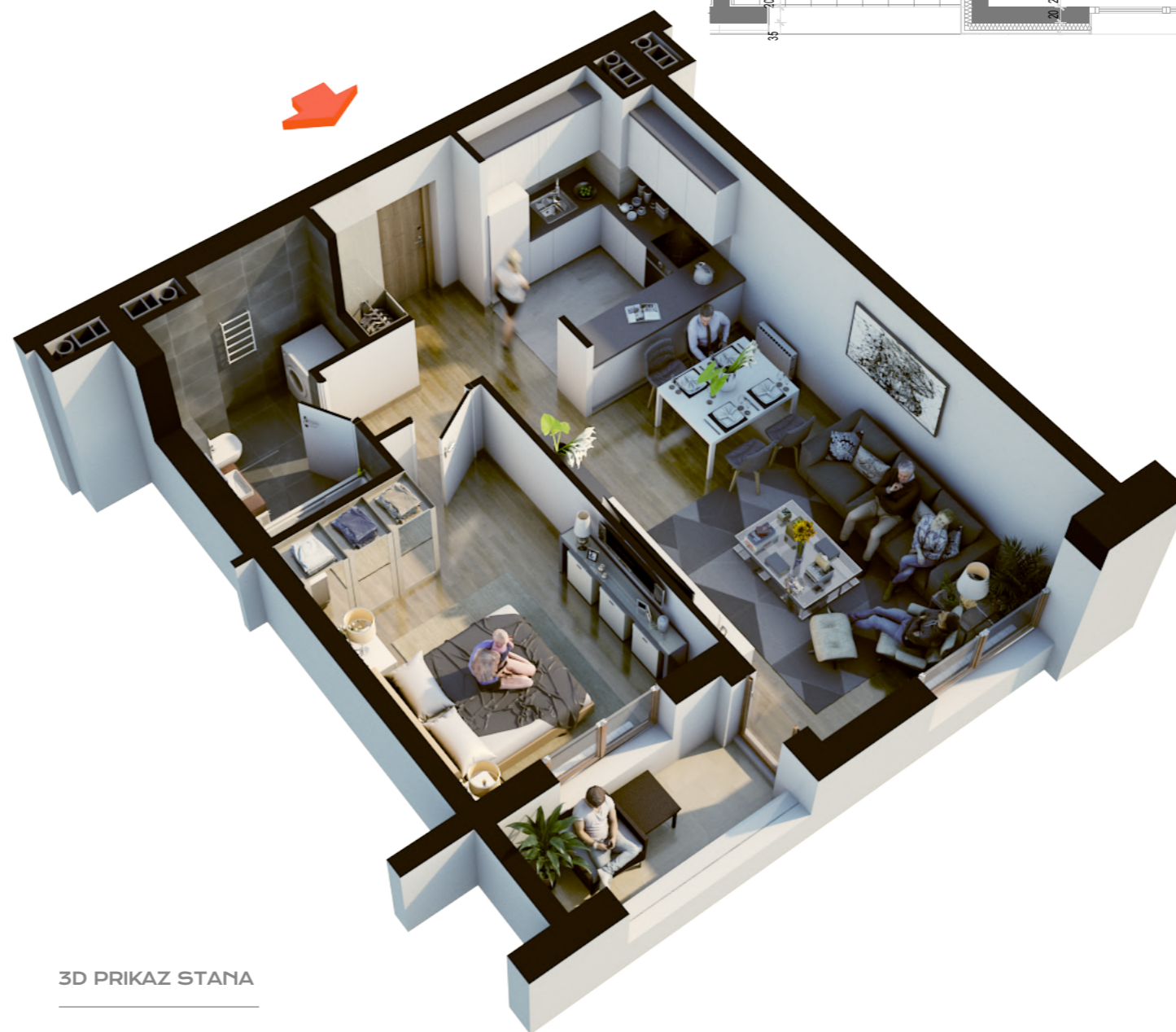
3D PRIKAZ STANA