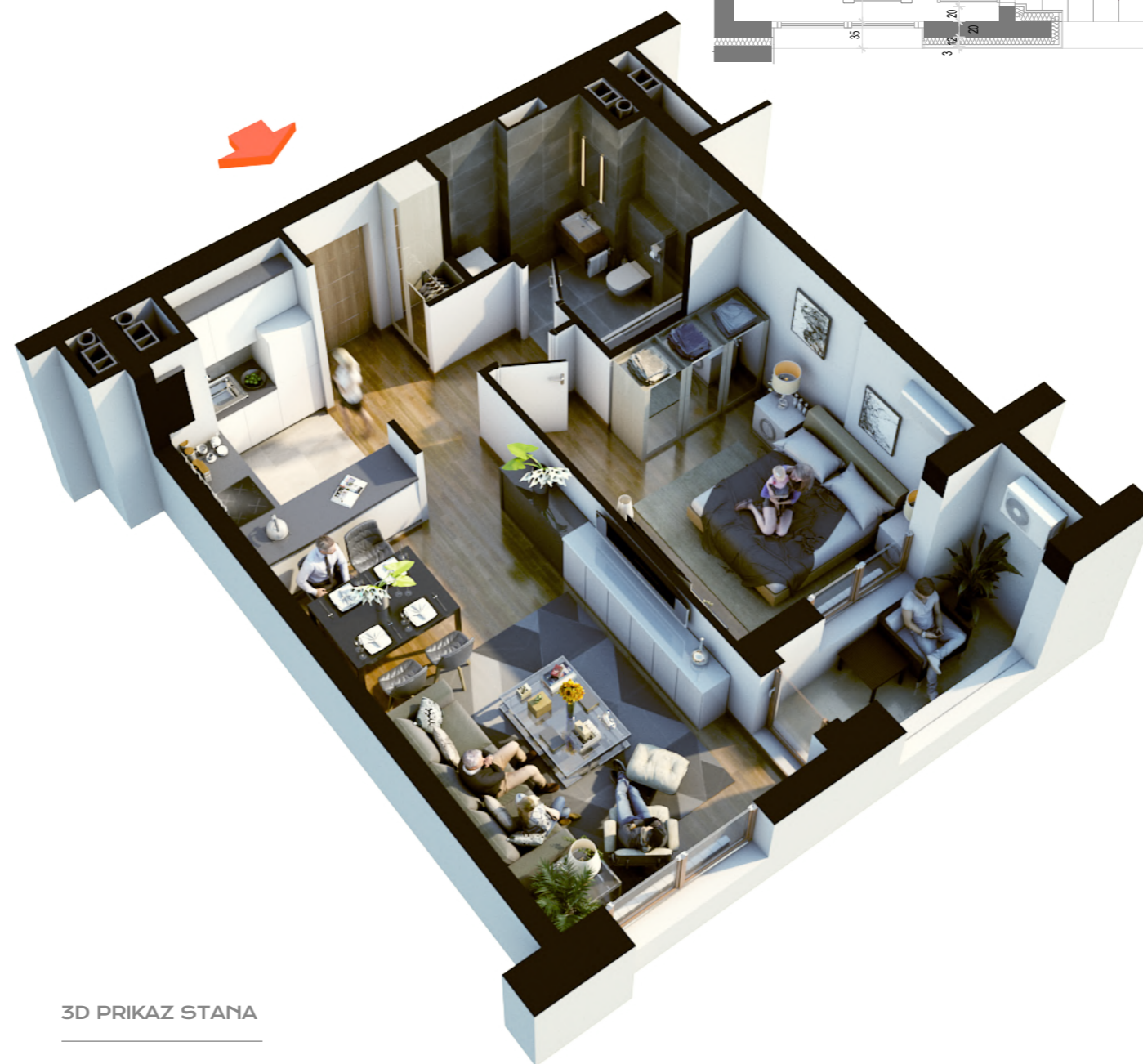
3D PRIKAZ STANA