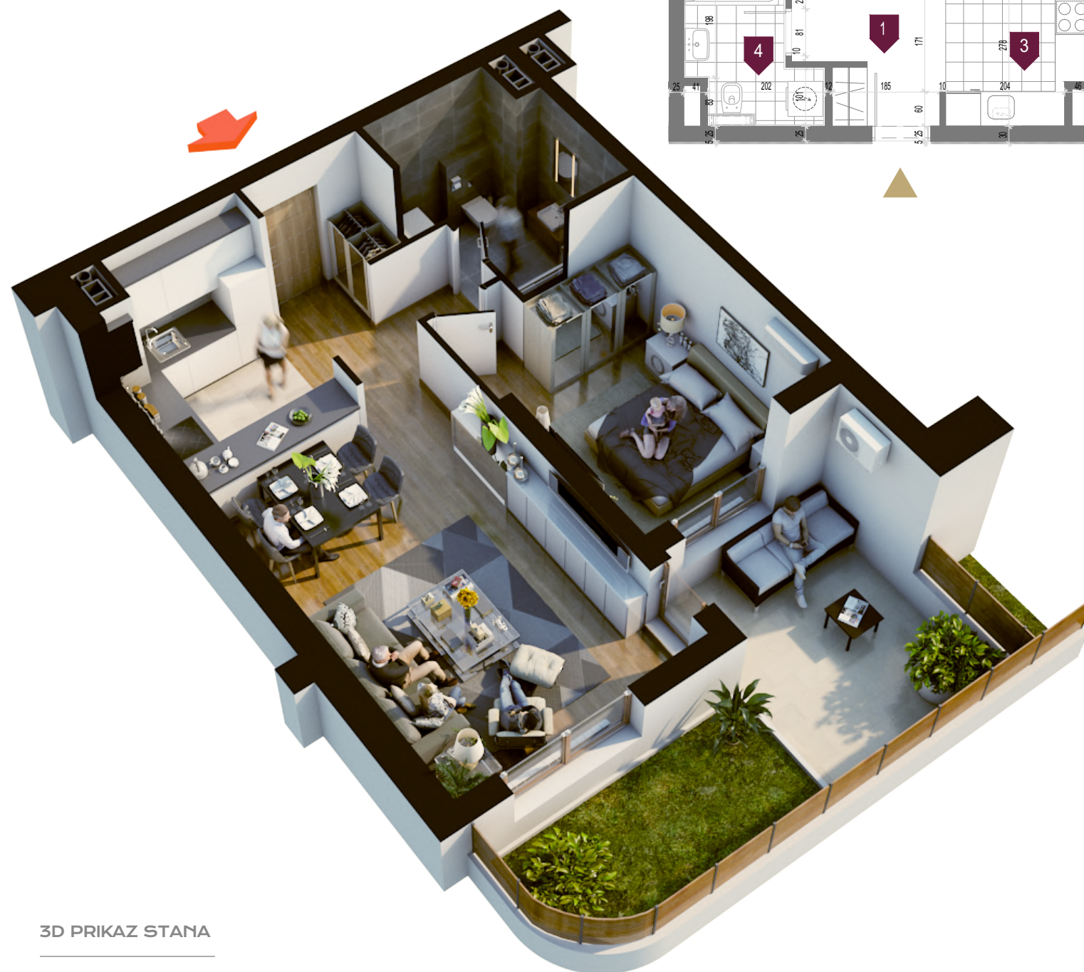
3D PRIKAZ STANA