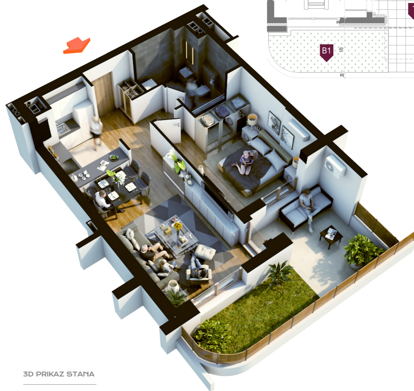
3D PRIKAZ STANA