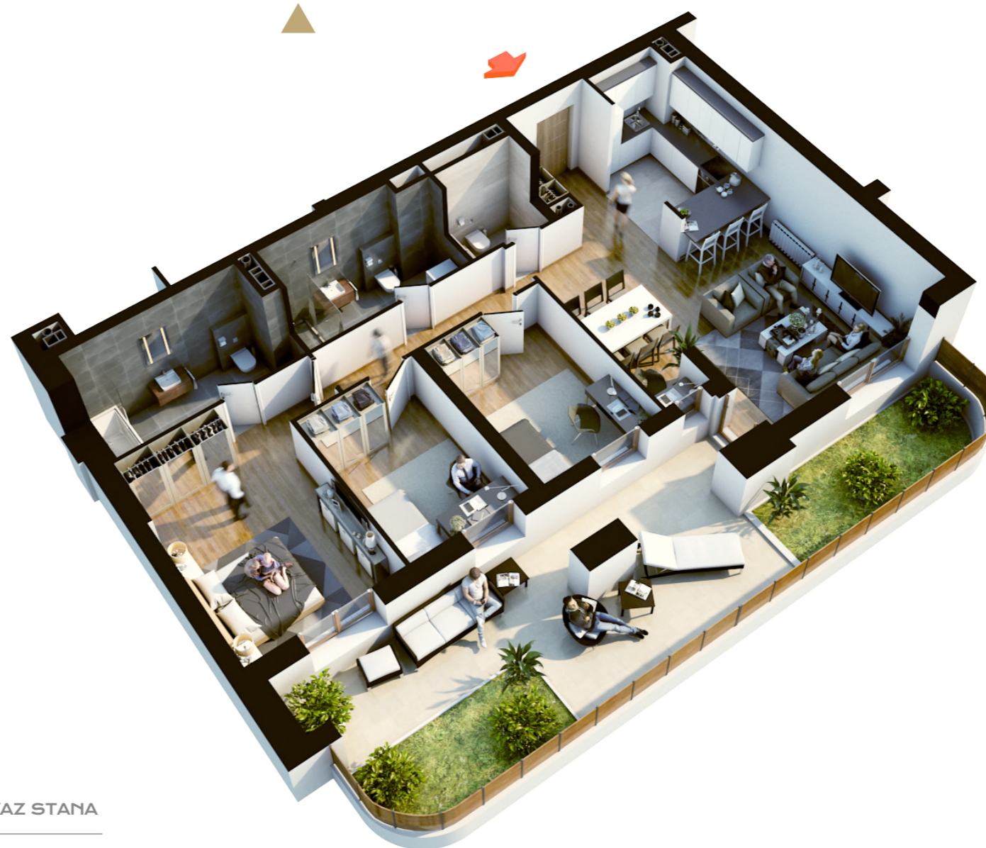
3D PRIKAZ STANA